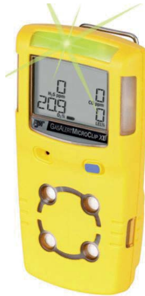
ART.BW.44370369 DETECTOR MICROCLIP XL (4 GAS)

ART.BW.CLIPHB-CASE: HIBERNATION SHELL FOR GASALERTCLIP EXTREME "H2S-CO"