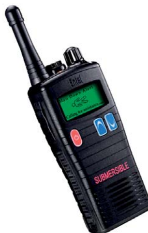
ART. HT953Ex ATEX II2G - EEx ib IIC T4 RADIO ATEX TRANSCIVER

Professional without license (PMR446), intended for use in ATEX hazardous areas. Certified according to European standards, complying with MIL STD810CDEF and watertight with an IP68 protection rating. 1800mAh Lithium battery, large display, ergonomic controls designed for use with gloves. Battery charge indicator. Integrated Voice Scrambler activated by pressing a button, this function ensures privacy. 15 hours of autonomy (standard cycle). Just press a button to instantly contact one, ten, a hundred people, without expensive subscription fees.