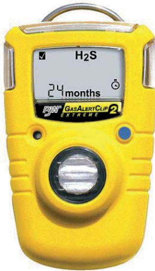
ART.BW.44370085 SINGLE GAS DETECTOR GASALERTCLIP EXTREME "CO" 24 MONTHS

Single-gas detector. It does not require calibration, sensor replacement and maintenance. GasAlertClip Extreme is compatible with the automatic MicroDock II control station; its simplicity, together with minimal training needs and irrelevant maintenance costs, makes it one of the most convenient protection tools for both internal staff and external collaborators. Large LCD display, displays alarm displays, peaks encountered on request, daily self-test activated by the user, internal vibration alarm for high-noise environments, transmits gas alarm events. Dimensions: 2.8 x 5.0 x 8.1 c. Weight: 76 g. Evaluations: EMI / RFI: According to directive 89/336 / CEE IP 66/67. AVAILABLE FOR H2S, CO, O2. Packing: 1/10