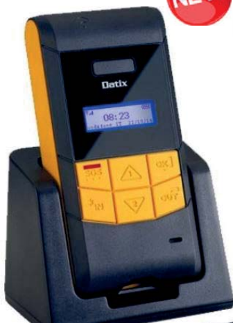
ART.GS.WP4 MEN DOWN ALARM (as required by law)

This device integrates the extended "Ground man" function capable of automatically sending an alarm signal, together with the GPS position (if outdoor), in the event of a fall (loss of verticality), prolonged immobility or when the SOS button is pressed, using SMS, GSM and GPRS carriers. It uses RFID reading technology to manage location in a simple way (as if it were an access control). To readings in memory, the alarm will include the last visited positions, so as to speed up searches. Finally, the instrument is also a GSM phone, capable of dialing numbers (quick or from the phone book) and be called, with a filter being received.