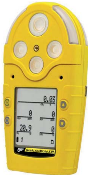
ART.BW.MC5PID DETECTOR MULTIGAS "GASALERTMICRO 5 PID" (VOLATILE ORGANIC CHEMICALS)

Unmatched in its versatility, it can monitor and display up to 5 potential gases in the atmosphere. Simplicity of use and calibration, automatic test of control. Robust housing and anti-shock. Three types of alarm (audible, visual and vibrating). Four levels of alarm: Low, High, TWA and STEL. Equipped with a 95 dB alarm ring tone and two large light alarm bars. Backlit LCD display with backlight option. Water-resistant. Powered by a rechargeable battery kit, including battery charger. Dimensions (H x W x D) 14.5 x 7.4 x 3.8 cm.