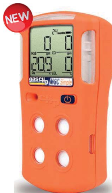
ART.GC.MGCP DETECTOR MULTI GAS (4 GAS) O2,CO,H2S,LEL

Simple one-button operation, standard datalogger, nr. 30 event recording. It offers continuous visual confirmation of its operating and efficiency conditions. Shock-proof protection. Continuous LCD display shows the concurrent gas concentrations for H2S, CO, O2 and fuels (0-100% LEL). Powered by lithium battery (generally 25 hours of operation; recharging in less than 4/6 hours). Alarm bell and large light alarm bars (typical), vibrating internal alarm for very noisy areas. Fully compatible with automatic docking station test. Automatic integrity test for: circuit, battery, sensor and audible / visual alarm integrity. Dimensions: 11.8x6.1x3 cm (H x L x P).