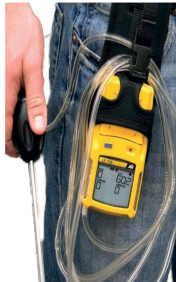
ART.BW.44370080 DETECTOR GASALERT MAX XTII With integrated sampling pump and datalogger

Multigas detector with integrated sampling pump, can reliably and safely control up to four hazardous gases and combines simple one-button operation. Compact, lightweight and water resistant, it activates visual, acoustic and vibration alarms in LOW, HIGH, TWA or STEL alarm conditions with alarm set points for all the sensors that can be defined by the user. The new integrated pump makes access to confined spaces and remote sampling, simple as never before, equipped with standard sampling tube of mt. 3 (on request it is possible to supply the pipe up to a length of 20 meters). It is equipped with rechargeable NiMH batteries. Dimensions: 13.1 x 7 x 5.2 cm (H x W x D). Weight: 316 g.