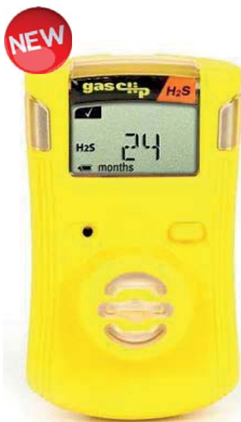
ART.GC.SGC DETECTOR MONOGAS "24 MONTHS" H2S-CO-O2

Unmatched sensor reliability for H2S, CO or O2. Adjustable alarm set points and real-time gas reading capability. Resolution of 0.1 ppm for sensor and H2S display. Two-way IR communications for event downloads, bump tests and updates. Individual identification of the programmable detector. Simple to use with a single button, confirmation / identification "Bump Check". No hidden service costs or maintenance costs. Light and resistant, clip for attachment. Records 25 events: the most recent ones replace the previous events. Autotest with functionality complete with activation and every 20 hours. Continuous automatic battery tests Dimensions: 85.5 x 48 x 29 mm.