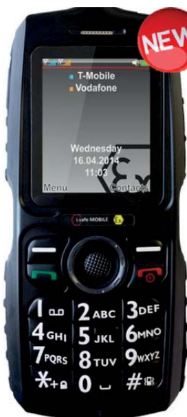
ART.CHALLENGER 2.0 ATEX MOBILE PHONE GSM - IP68 FOR CONFINED SPACES

Mobile phone with basic equipment, reinforced, loudspeaker and powerful 2W LED flashlight. Challenger 2.0 is a very robust against dust and water. It is perfect for use in extreme conditions.