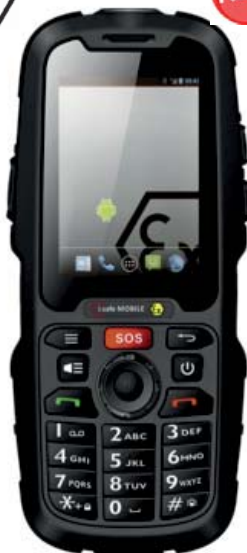
ART.IS310.2 ATEX MOBILE PHONE GSM / 3G - IP68 FOR CONFINED SPACES

The IS310.2 is the performance of the mobile phone with Android operating system Zone 2/22. The robust button cell phone offers many technical advantages: WiFi, Android, NFC, dual SIM, LED flashlight, large battery, loud speakers and SOS button. AndroidTM 4.2 Jelly Bean 3G, Bluetooth 4.0