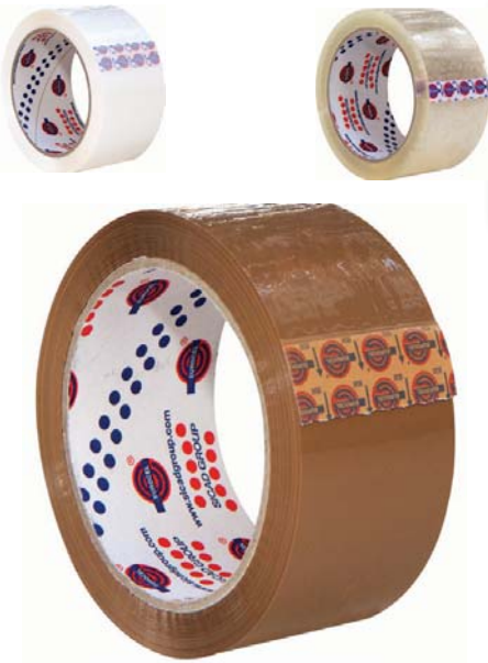
ART.EU.PP36NN TAPE PACKING MM 50 X 66 MT. COLOR: HAVANA, TRANSPARENT, WHITE

Packing adhesive tape THICKNESS 0,048 thousandths. Support BOPP acrylic adhesive. Unrolling silensioso, extra tough. Resistant to aging. Availa- ble in colors: Havana, whi- te or neutral. Dimensions mm 50 x mt. 66.