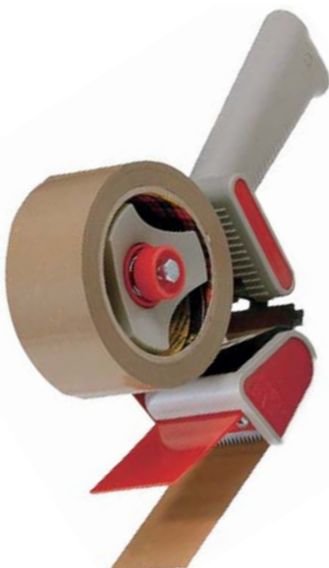
ART.3M.H180 TAPE DISPENSER

Tape dispenser for tape roll packaging. Adjustable, hub-mounted tape brake offers control of tension and delivery.