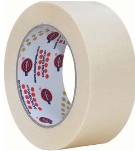
ART.EU.MSK60.38 PROFESSIONAL BODY SHOPS MASKING TAPE MM.38

Masking tape suitable for the building and bodywork sector. Support from 58 gr / mq. adhesive in dry natu- ral rubber and resins, total thickness 125 microns. On removal, it does not leave adhesive.