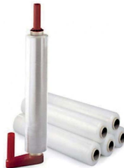
ART. SB.518 MANUAL STRETCH FILM

Stretch film with manual unwin- ding in polyethylene for packa- ging.