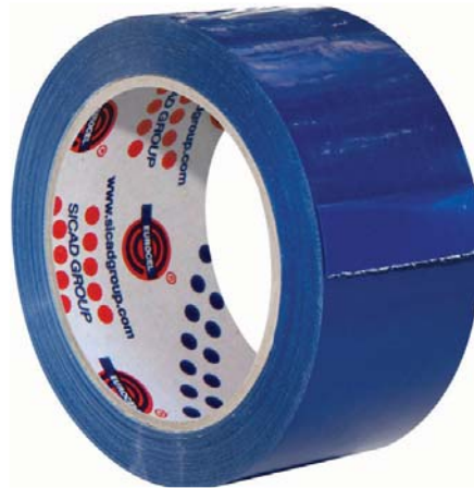
ART.EU.PVCCO TAPE COLORED PVC ADHESIVE MM.50

PVC tape, thick 59 micron rubber adhesive. Optimal for packaging and various types of operations. Available in colors: blue and yellow.