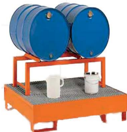
ART. SB.E202 CONTAINER STORING FOR 4 TANKS

Container for storing and displacing of drums filled with environment dangerous liquids. Made of watertight steel sheet. Hot galvanized movable grid shelf made steel - Capacity 280 litres. (WITHOUT SUPPORT).