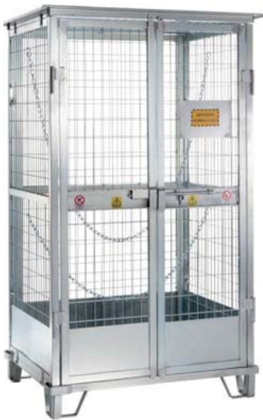
ART. SB.DEPBOMB STORAGE FOR 9/12 TANKS

Grid walls with closed bottom. Two hinged doors with latch, designed to lock with a padlock. It is delivered assembled. Steel structure particularly robust, welded and hot-dip galvanized for use in outdoor environments. Fork entries. Size cm.: width 113, depth 96, height 197.5.