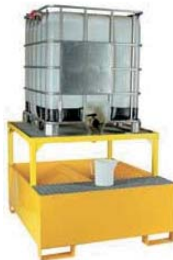
ART.SB.E207 CONTAINER INCLINED TANK

For tanks from lt. 1000 or 6 drums of 200 lt. Grilled in galvanized and varnished tub in eposyric. Prepared for cart handling.