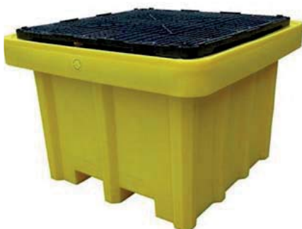
ART. SB.PE1000 TANK CONTAINER FOR 1 TANK

Polyethylene collection tank for 1050-litre container.