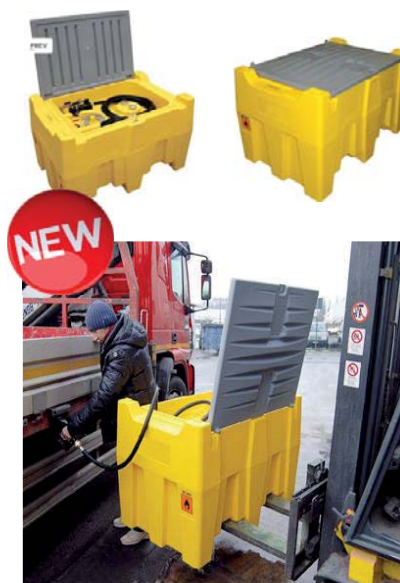
ART.C.SER440 TANK FOR OIL-EXHAUST ADR 1.1.3.1 .C

Transport PE tank with electric pump. Counter and gun with automatic stop with 4 m of carbopress tube, 4 meters of electric cable and clamps for connection to the battery. Transportable oil tank produced in linear polyethylene with rotational molding. Procedure that makes the structure compact but at the same time light. The equipment includes: 2-piece aluminum filler cap, double-valve safety cap. Safety faucet transfer unit. Swivel connector inlets for full lifting with forks. Handles for vacuum lifting ..